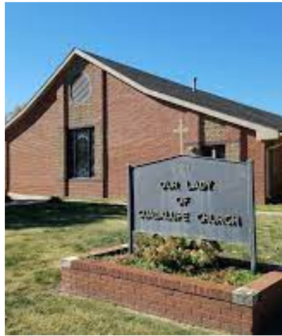
Our Lady of Guadalupe

(316)282-0459 106 E. 8th St. Newton, KS 67114