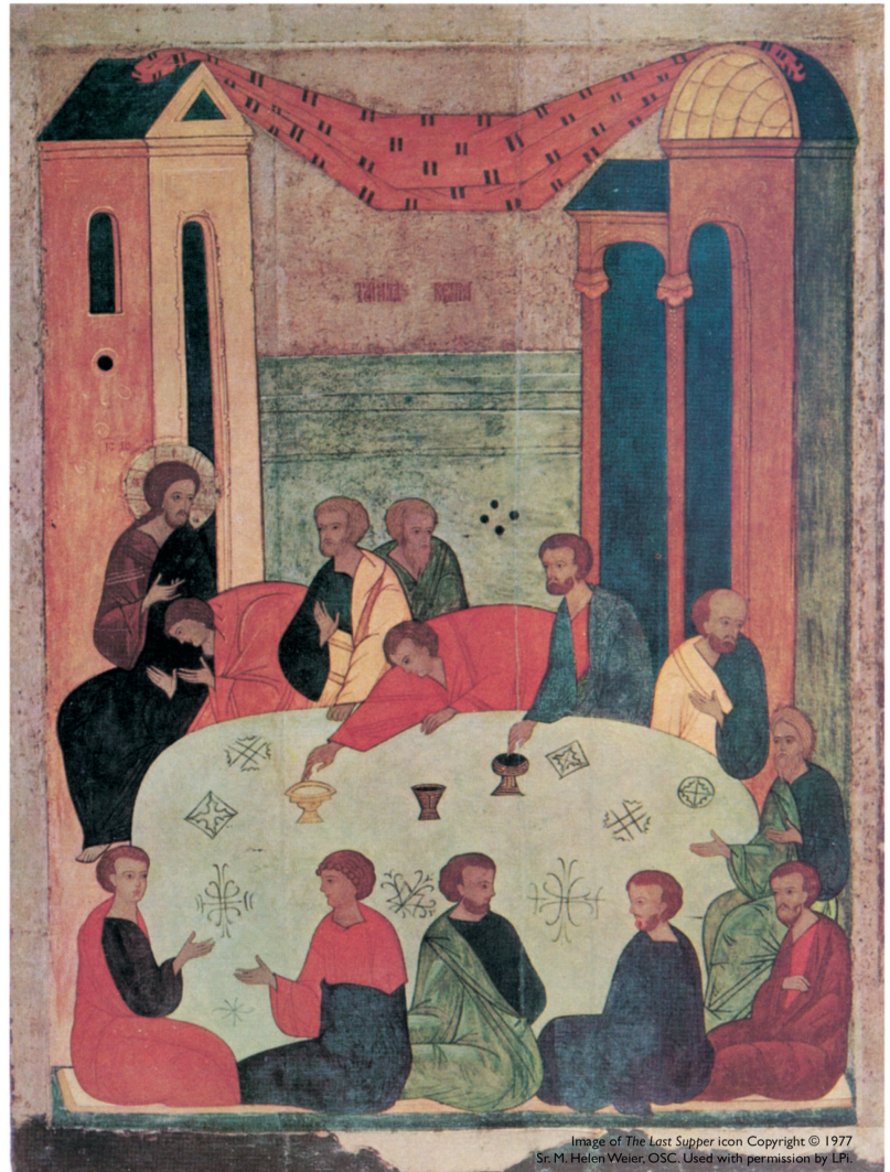
Image of The Last Supper icon

To be companions with Christ in transforming our surroundings with the love of the Father, the Son, and the Holy Spirit.