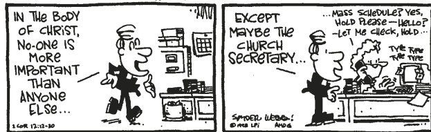
5 RD SUNDAY IN ORDINARY TIME

The Knights of Columbus will recite the rosary twenty minutes prior to the weekend masses (Jan. 30-31). This is an event that is encouraged under the K of C Fifth Sunday program. All parishioners are invited to come a little earlier to the mass of your choice and join us in reciting the rosary.