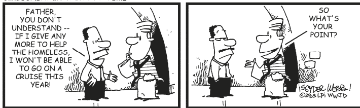
32nd SUNDAY IN ORDINARY TIME