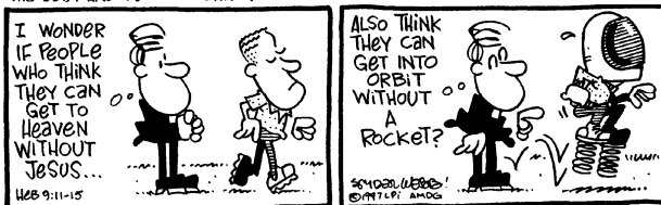
THE BODY AND BLOOD OF CHRIST