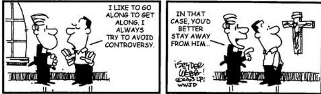
PRESENTATION OF THE LORD

Thank you to all who made Catholic Schools week a huge success. The students and families of St. Mary School appreciated all the volunteers help with the various activities. For pictures of the relics display check out facebook. Some where posted there this week.